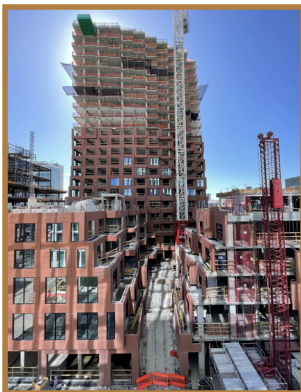
Progress at The Canyon