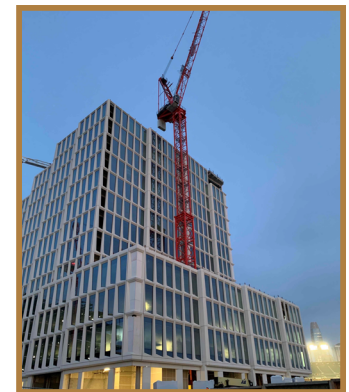
Progress at the Visa Building

General construction can occur during the hours of 7 a.m. to 8 p.m., seven days a week, including holidays.