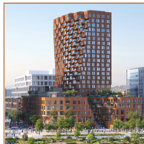
Rendering of Building A