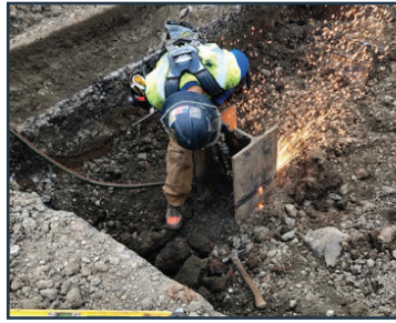
Pile cut off