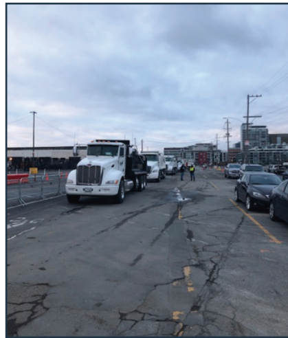
HVYW8, Inc. trucks lined up for off haul