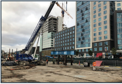
Setting up pile load test