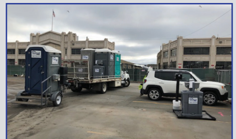
Extra hand wash stations and porta potties