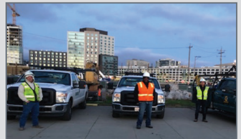
Meetings with social distancing