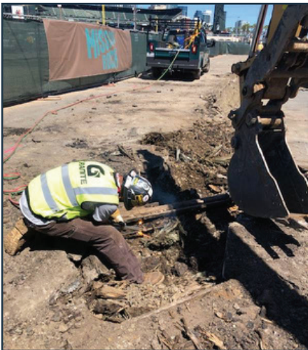
Removal of underground obstructions – old footings and railroads tracks