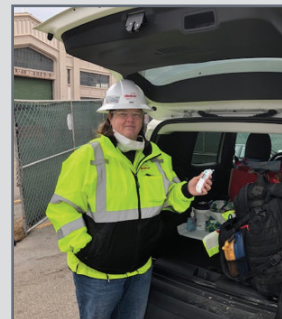
Paramedic ready with thermometer

A full-time medical technician joined the team to help screen workers for fever and other symptoms related to COVID-19. Extra hand washing and disinfectant stations have been brought on-site, and other strategies including social distancing adds levels of precautions to our everyday work.