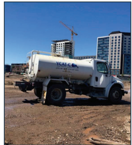
Y-CAT performing dust control